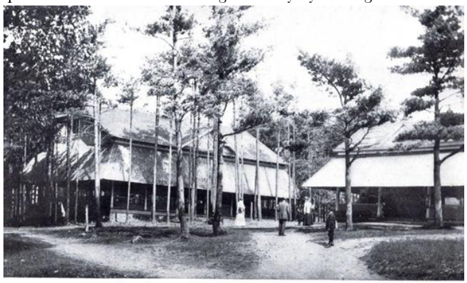
Pine Grove and Pavilion, Averill Park, N. Y.

-One of the prettiest stretches of country in this part of the state is that which the cars of the Troy and New England Railroad traverse on their trips to and from Averill Park. The road winds across level strips of farm land, through forests, across picturesque streams, by attractive residences, along pretty country roads and past some of the prettiest rural beauty spots In Rensselaer County, Averill Park is an ideal summer resort. It is in the midst of handsome trees, on a slight rise of ground and is swept by the cooling breezes of the Hudson valley. Around and about the place are beautiful hills and a number of fine bodies of water, where the fishing and boating are unexcelled. Sand Lake has long been a favorite resort for fishermen, and many go there to explore the beauties of its wooded shores in rowboats on pleasant days. The park in the village is a fine pleasure resort. Concerts are given daily by Doring's Band of