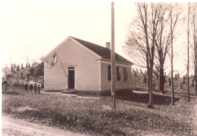
District No. 6, Sliter's Corner School is near NYS Route 150 on County Route 50. This school has been converted into a house. Black marks left by the old school desks are still visible on the pine floor.