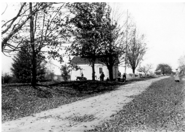
District No.1 was located on the west side of Burden Lake at the northwest corner of Sheer and Bittiig Roads.

Does anyone know the location of any of the places in quotes?