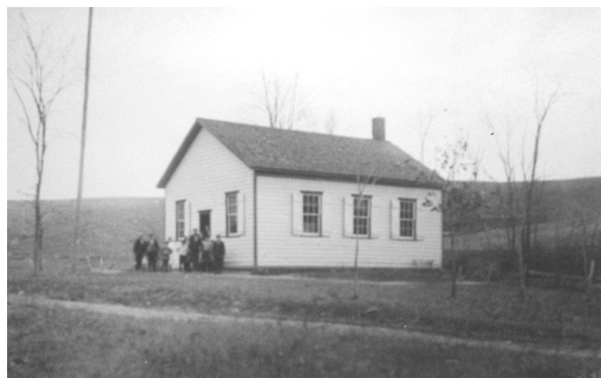
District No. 3 was located in the southwest corner of town. No mention is made of its joining the district.