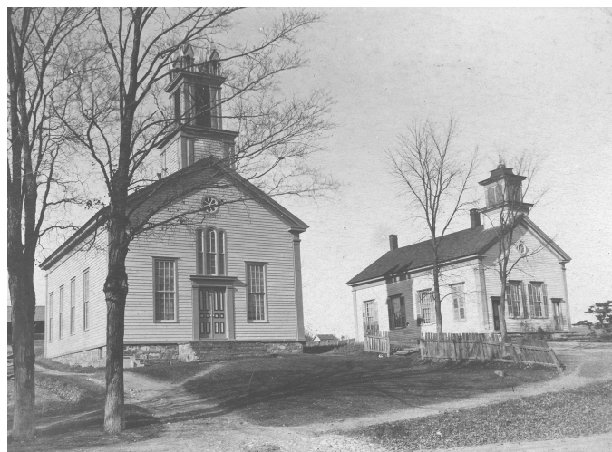
District No. 4 for the West Sand Lake area was next to the Salem United Brethren Church on Route 150. Class pictures were often taken on the steps of the church. Today, with its second story, it is an apartment house.