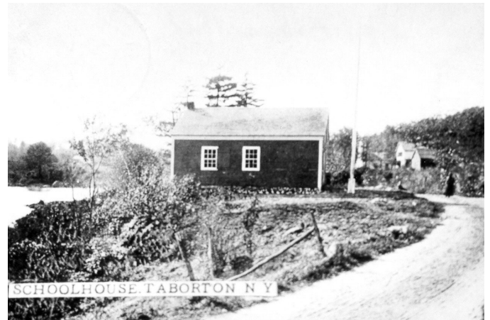
District No. 11, Taborton School was located on the shores of Little Bowman's Pond. There is a house on the site of this school.