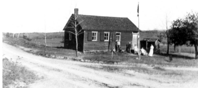
District No. 2 was on the east side of Burden Lake at the northeast corner of Holcomb and Methodist Farm Roads. No mention is made of its joining the district.