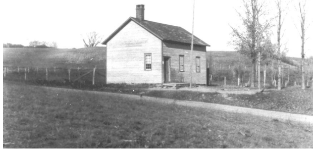
District No. 5, Miller District School was on Thais Road. No mention is made of its joining the APCSD.